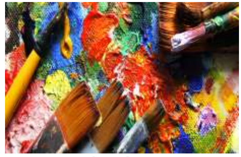
Kids Art Classes